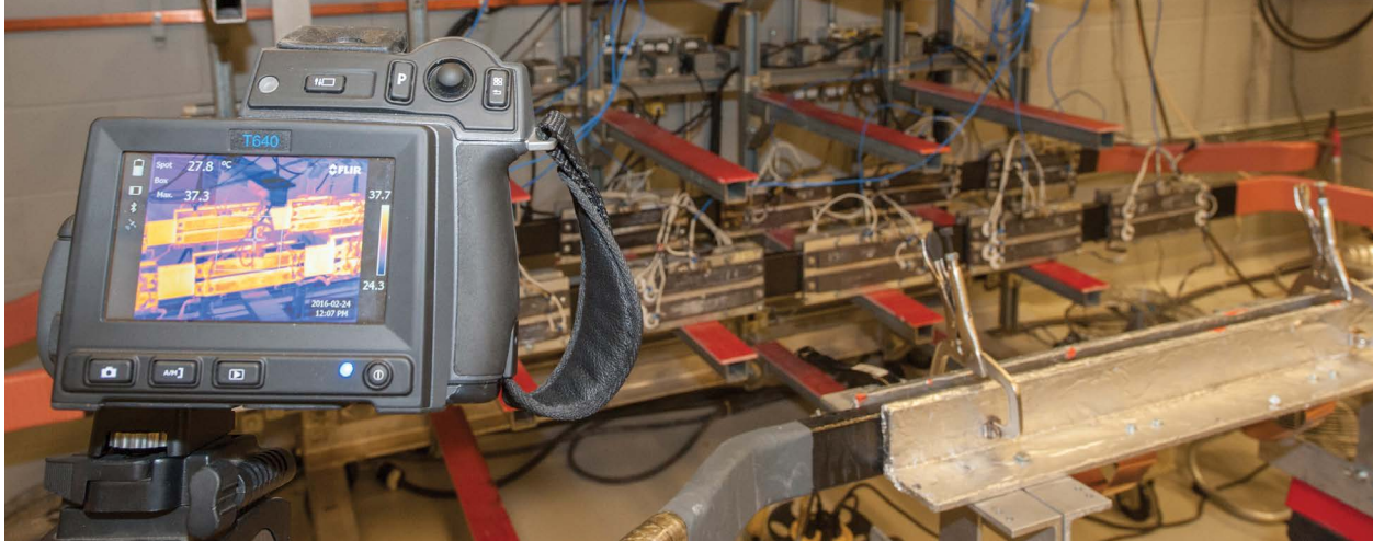
Infrared imaging of stator bars during voltage endurance testing.