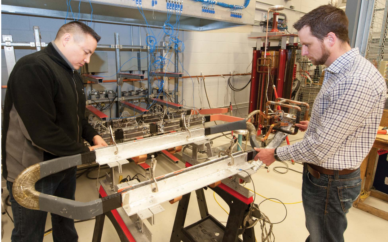
Stator coil being prepared for voltage endurance testing.